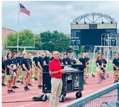
Breakfast with the Band

After a couple of weeks of spat camp, family and friends are invited to gather on a Saturday morning (see schedule on lincolnband.org website for date, location and time) to hear the show music for the first time. The students will also be posing for a large, all member photograph this morning (typically wearing their black band t-shirt and tan shorts; color guard will be instructed what to wear) These photos will be for sale as a poster print later in the season. The Band Parent Association (BPA) will be selling doughnuts and coffee as a fundraiser. There will also be several tables set up to visit, including band merchandise sales, volunteer sign-ups for a wide variety of needs throughout the season, and fundraising opportunities for your student and the BPA. Be sure to attend this first glimpse of what your students have been working so hard on these past few weeks, grab a donut and coffee, and get to know your fellow bandparents! This event typically lasts 2-3 hours.