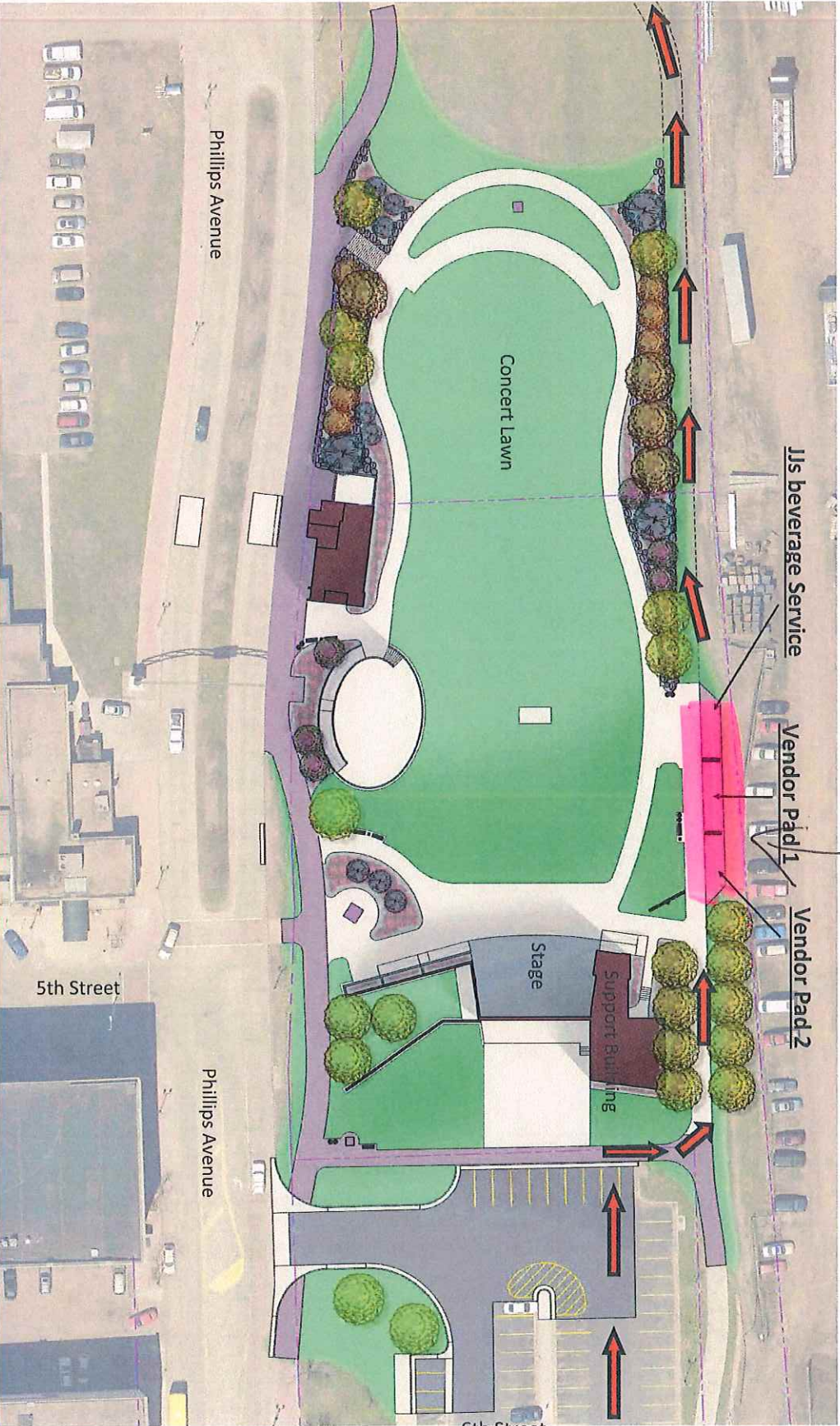
Sioux Falls Levitt Shell Food Truck Map